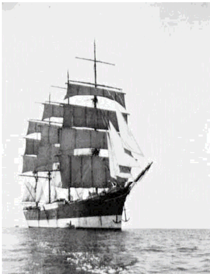
PASSAT (1911-1959), a four masted barque that plied the South American nitrate trade and Australian wheat trade.