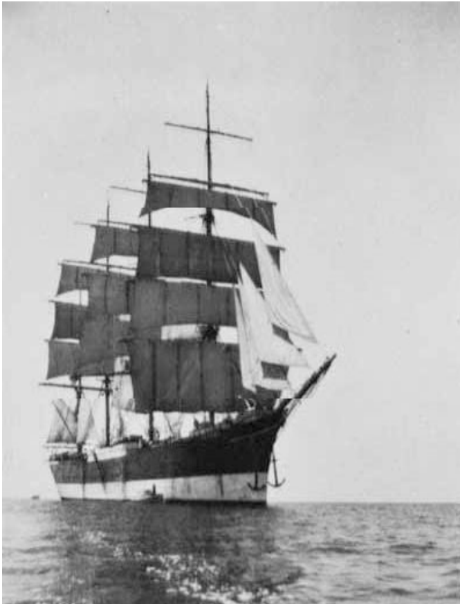
PASSAT (1911-1959), a four masted barque that plied the South American nitrate trade and Australian wheat trade.

The Australian Association for Maritime History was formed in May 1978. Its main aim is to promote the study, publication and general appreciation of maritime history. Membership is open to anyone with an interest in maritime history.